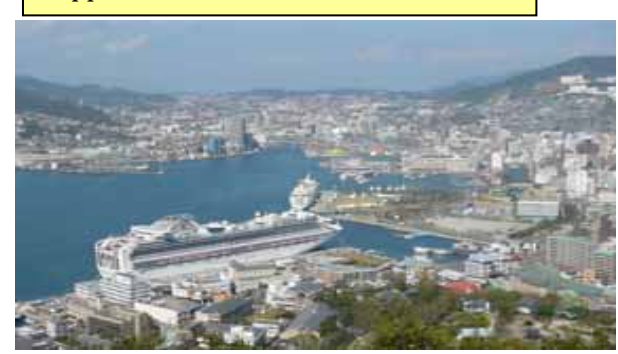
Sapphire Princess (116,000GT)

In the Matsugae region, every year many international tourist ships visit Nagasaki Port. In order to accommodate large tourist ships, improvement work has been carried out to make Japan's first facilities which can accommodate ships of 100,000t level. This work was completed in 2008. In addition, new work will start on an international terminal building and a green space behind the pier in April 2009. This work is scheduled for completion in March 2010.