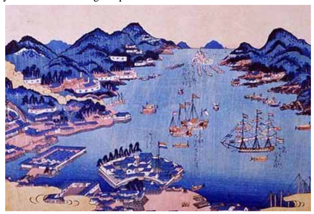
(Nagasaki Print [Map of Nagasaki Port] )

Nagasaki Port was opened to foreign trade in 1571 because Portuguese ship had entered the port and requested the trade. After that, Dejima was constructed in 1636 as a part of the national isolation policy of the shogunate and the Portuguese were accommodated there. However, the Portuguese were prohibited from entering the country by the fifth isolation order in 1639, after which Japan was limited to trade only with the Netherlands and China, and national isolation was complete. In addition, the Dutch trading house was moved from Hirado to Dejima, and their trade was limited to Nagasaki Port. In the period of national isolation, the trade with Netherlands and China was put under the management of the shogunate. New warehouses for keeping Chinese imports temporarily were constructed in 1702. Nagasaki Port continued to prosper as the the only gateway to the world during the period of national isolation.